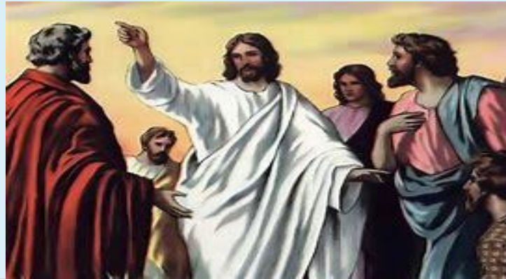
You are just, O Lord, and your judgement is right; treat your servant in accord with your love.

O Lord, grant that I may not so much seek to be consoled as to console; to be understood as to understand; to be loved as to love. For it is in giving that we receive; it is in pardoning that we are pardoned; and it is in dying that we are born to eternal life. AMEN